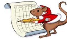
Mark Your Calendar

YOUNG YOUTH (4 th , 5 th & 6 th graders)