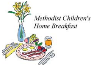
Methodist Children's Home Breakfast

Sponsored by the St. Andrews Sunday School Class